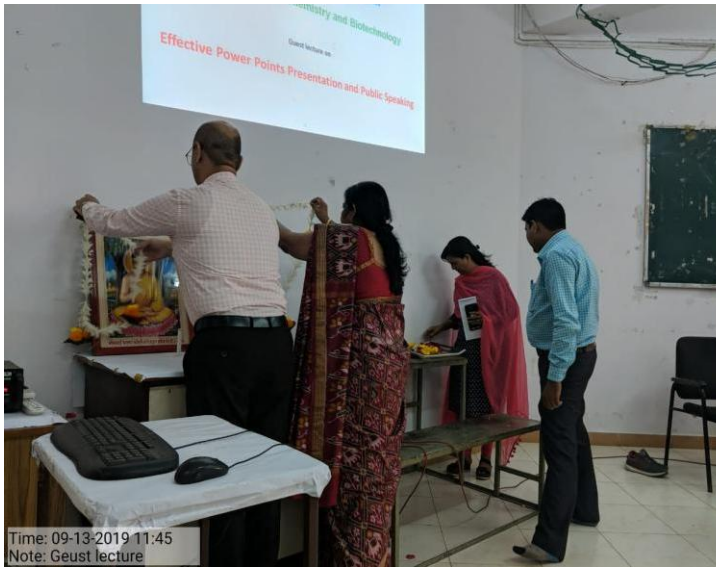
Garlanding of the portraits