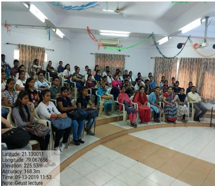
Audience in the guest lecture